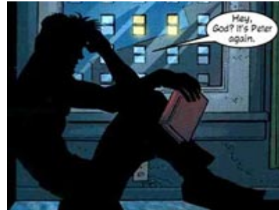
In the comics, Parker has turned to God in prayer

without a cost. But know that through all the lessons you've learnt as a believer, a ranger, a student, a son/ daughter; it will make you a stronger person inside and out.